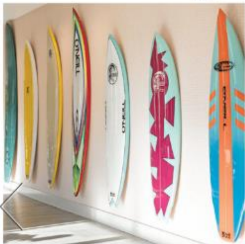
Clockwise from top: Guest rooms at the iconic Dream Inn look out toward the beach and boardwalk; the pool deck at Hotel Paradox features a freestyle lounge as well as private cabanas and Indonesian daybeds; custom-made surf boards at the Dream Inn's lobby speak to the area's favorite pastime and honor surf legend Jack O'Neill.