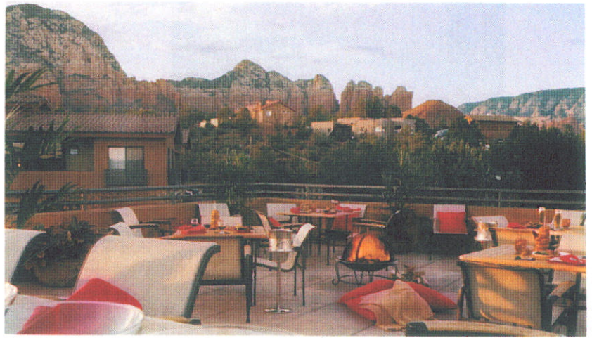
above: Sedona Rouge Hotel and Spa rooftop

Wherever you travel, look for a spa providing relaxation, rejuvenation and recreation that match your interests and goals. And above all, consider spa-tacular destinations set in spectacular scenery—where doubling the enjoyment quotient comes naturally. Options abound throughout SkyWest Country. Profiles of more of our favorites follow. ■