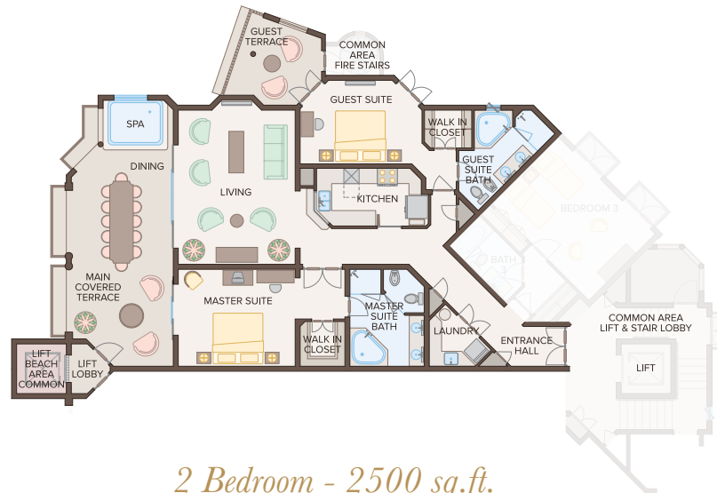
2 Bedroom - 2500 sq.ft.