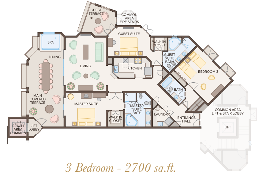
3 Bedroom - 2700 sq.ft.