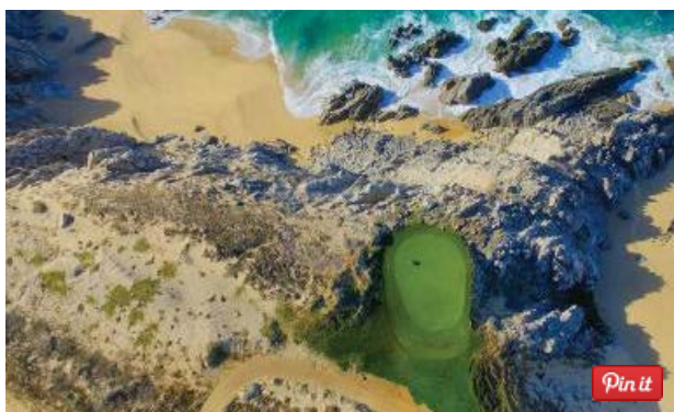
Pueblo Bonito Golf, Cabo San Lucas.