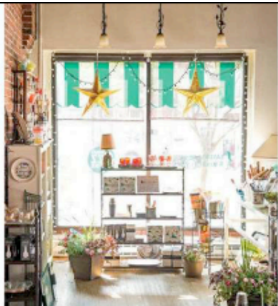
Clockwise from this picture: Vena's Fizz House; Maine Craft Distilling; Eventide oyster restaurant; interiors shop K Colette; carpet at the Press Hotel; exterior of the hotel