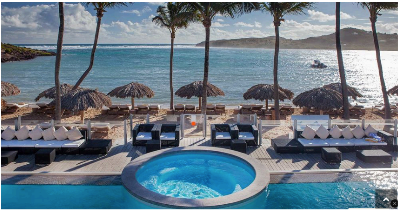
Hotel Guanahani & Spa