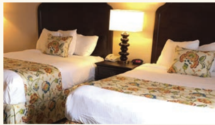
DELUXE TWO QUEENS