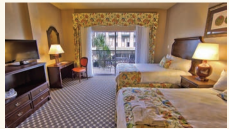
DELUXE TWO DOUBLES