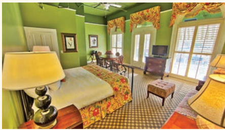
ALAMO PLAZA KING

Varying in size and layout, our delightfully furnished Junior Suites have one king bed or two double beds and a comfortable sitting area with a writing desk and chair.