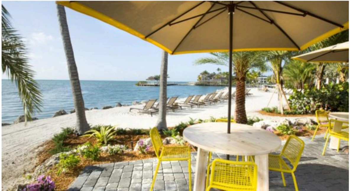
Pelican Cove Resort in Islamorada