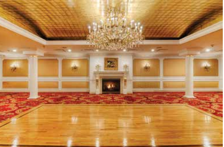
CAPACITY CHART Over 30,000 sq. ft of meeting and event space