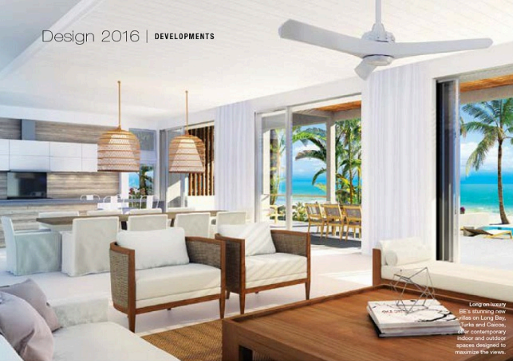
Long on luxury BE's stunning new villas on Long Bay, Turks and Caicos, offer contemporary indoor and outdoor spaces designed to maximize the views.